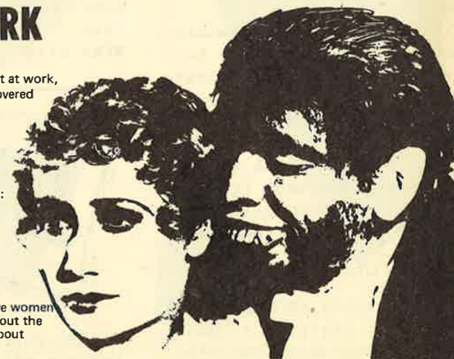
Dr. Jekyll and Mr. Hyde (Paramount 1931)

The branch has negotiated time off for members to attend. Ask your supervisor for permission.